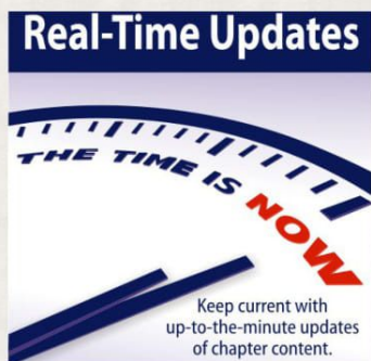
Real-Time Updates keep Bovée and Thill textbooks current for instructors and students.

To order an examination copy of a Bovée and Thill text, visit the ordering page