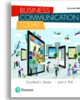
Business Communication Today

16 chapters; paperback Best choice for courses that focus on writing and public speaking, with integrated coverage of technology