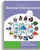
Excellence in Business Communication

14 chapters; paperback Best choice for shorter courses and courses that emphasize fundamental business English skills