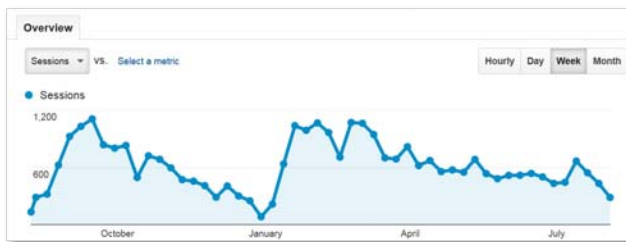
Source: Google Analytics

Seasonal surges in traffic, corresponding with the September and January terms, show how these free resources are being integrated into course experiences at hundreds of colleges and universities.